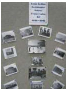
A panel from the Lejac Residential School Photo Display

A goal for the Student Services division this year is to improve awareness of internationalization and indigenization, and a variety of workshops are being held. "Check Your Assumptions" (challenging our assumptions about other cultures) was offered at our fall staff meeting and other sessions have also been well-attended by our group. We have been updating library collections in these topics, and supporting related events. During BC Truth and Reconciliation Week, Media Services assisted with streaming the Commission's webcasts, and the Aboriginal Resource Centre set up a special Lejac Residential School photo display in the library.