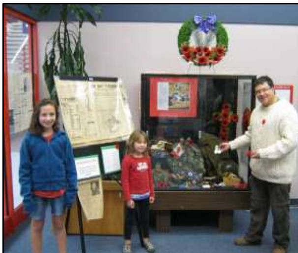
Remembrance Day display, by Sheldon Clare (CNC History)

We are now setting up Christmas displays: Chili Blanket (CNC Status of Women Committee), Food for Fines (CNC Student Food Bank), CNC Library Puzzle Tree (collecting puzzles for local transition homes and seniors centres); and a Holiday Greeting Wall where people can put up a post-it note, with greetings in their language of choice.