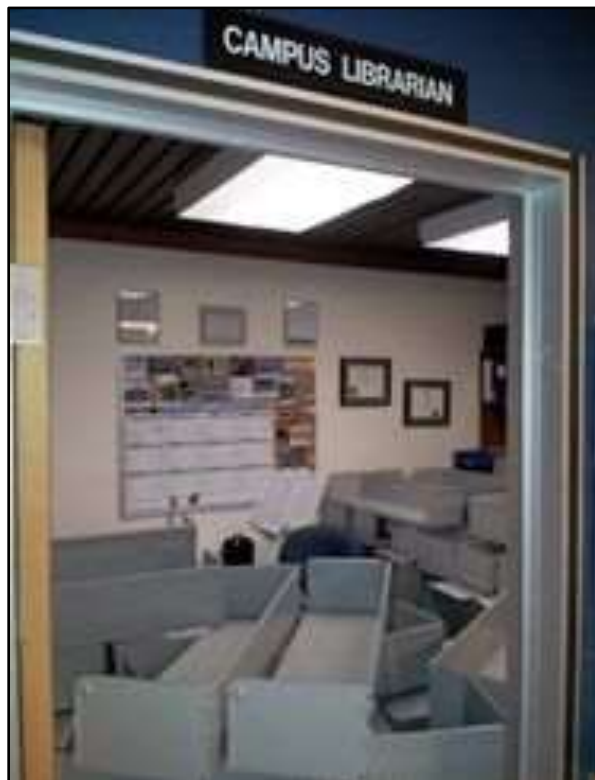
Librarian's office filled with shelving materials