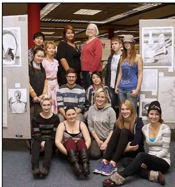
"Night of the Living Lead" Student Art Display

We also helped with other college initiatives: CNC Nursing Scrubs Donation boxes for Scholarships; CNC-SPCA Doggie Fashion Show (donation drop boxes in library); Operation Christmas Child (shoe boxes); International Education Student "Greeting Cards for Seniors."