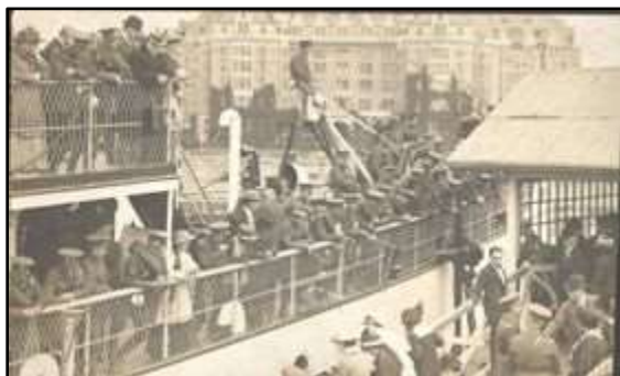
Troops leaving Victoria by sea, 1916.