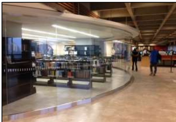
The new reserves area in SFU's renovated W.A.C. Bennett Library, which is part of a central "service circle" at the core of library's main (third) floor.

A two-year Vancouver campus Belzberg Library renovation is now complete, following the installation of new security gates and opening of the Wosk Student Learning Commons - a collaborative student space and home for academic writing, learning and research support services. The glass-enclosed room features moveable furniture and whiteboards, comfortable lounge seating and a cozy fireplace. For more, visit: www.lib.sfu.ca/belzberg