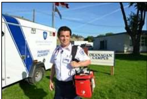
CBC's Rick Mercer as Paramedic for a Day

On September 9, 2013, the JIBC campus in Kelowna had one very notable and enthusiastic Canadian as a special visitor. That visitor was the