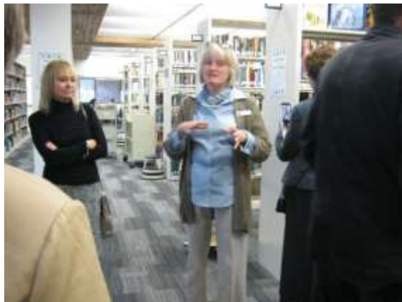
CPSLD Meeting Room and many compliments on the Food Service!