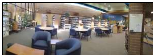
Library with new carpeting