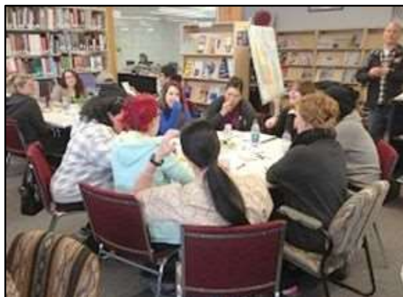
The open learning environment: the library hosted the student forum