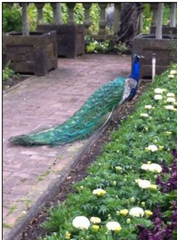
One of our new friends at Royal Roads University

June saw our cataloguers make the trip to Kelowna for training in RDA through BCCATS, as well as a staff trip to Victoria to connect with our colleagues at University of Victoria and Royal Roads University. We don't often have the opportunity to engage with our colleagues beyond Squamish, and the gracious welcomes, tours and conversations we had while at these universities convinced us to make a habit of these trips!