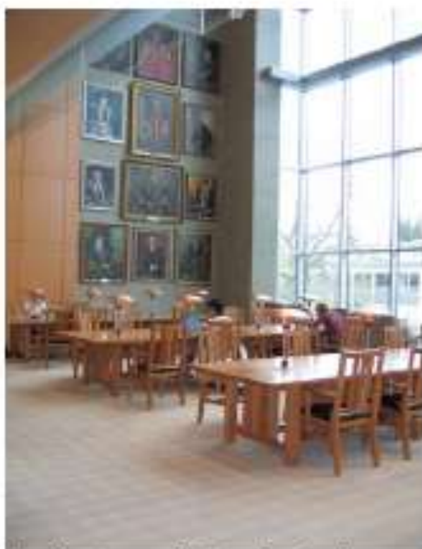
View from the new Ridlington Reading Room