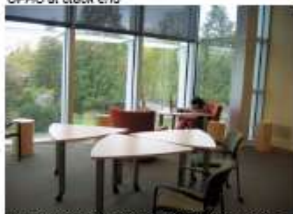
Movable furniture: chairs and tables on rollers