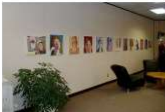
Art Wall - Visual Arts student self-portraits

Dawson Creek: The highlights of the past few months include having the Dawson Creek Library repainted in warmer shades (clay, ginger and teal). We also had our first Gallery opening with a display of the self-portraits of this year's Visual Arts students. It was well-attended and generated much TV and newspaper coverage. I wasn't here due to a family medical emergency and it was very gratifying to see how well everything went. The new budget has an allocation for a new Service Desk so hopefully we will see that in place this year.