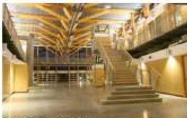
New Atrium in Quesnel