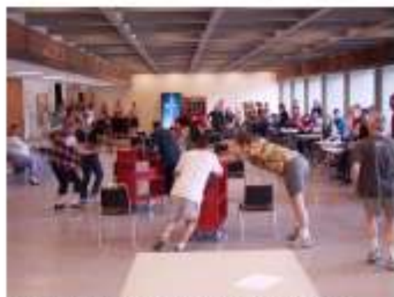
Slalom portion of the final race between the "Sugababes" (left) and the winners "Fat Chance" (right)

SFU Library staff presented the majority of the sessions but there was also some outside expertise brought in. The Book Truck Races were held again and lunch also featured a digital slide show of travel shots taken by Library staff.