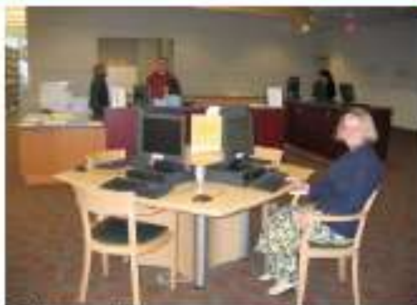
Public user stations