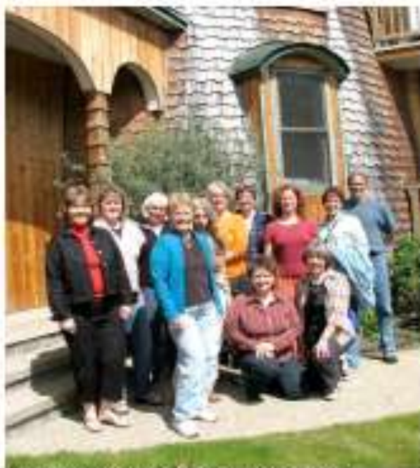
Selkirk College Library Planning Retreat

implement them. Without an increase in professional staff it will be a challenge to accomplish many of the library's goals.