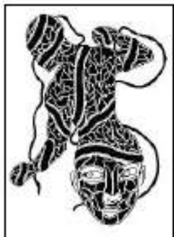
finished by © C.P., College Heights