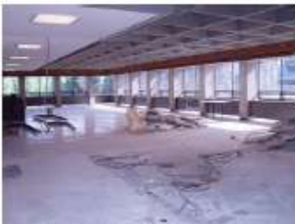
Bennett Library Renovations

Renovations finally got underway on the east end of Bennett Library's 3 rd Floor. The pictured space above will be split between a new area for the Media Collection and Document Delivery Services. Timelines are always difficult to predict but we are still hopeful that it will all be completed by September.