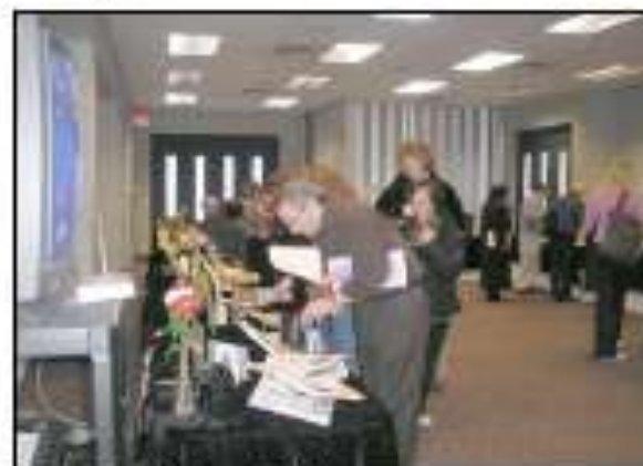
Published Authors Display

The BCIT Library was well represented at BCIT's annual PD day. Librarians facilitated two workshops for staff and the Library team created a Published Authors Display. We asked BCIT faculty and staff to tell us about any articles or books that they had published. The response was overwhelming and we used the information to create a bibliography and set up a display for PD Day. It was so successful that we used the same display during our biannual Open House for the public.