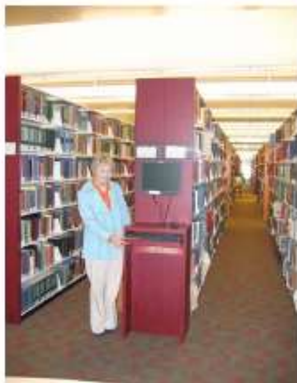
OPAC at stack end