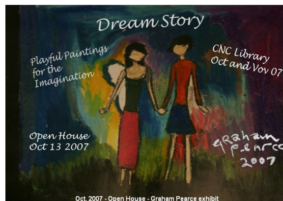
Oct. 2007 - Open House - Graham Pearce exhibit

For Open House in October, we set up two amazing art exhibits: "Dream Story" features paintings by CNC faculty member Graham Pearce. "Nightmare Somnolence" features the photography of CNC student Adam Buhler. Both exhibits have received a lot of media attention.