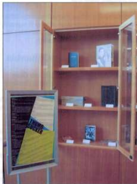
Photo of Thumbsucker exhibition

Staff members on the combined desk have come across many areas where art intersects with science. These encounters prompted a staff-curated exhibition titled Art and Science , revealing new titles to the AArP and Science & Engineering collections that embody such rich interdisciplinarity. The exhibition was on view until November 14 in the bookcases of the Ridington Reading Room, an elegant, inspiring and heavily used space in the Learning Centre for study and contemplation. Also on view in the Ridington Room was the Thumbsucker exhibition, which features book objects created by students enrolled in a 300-level Visual Art Theory course. As a non-conventional exhibition space, it is our hope that the Ridington Room will continue to host intriguing curatorial projects showcasing student work.