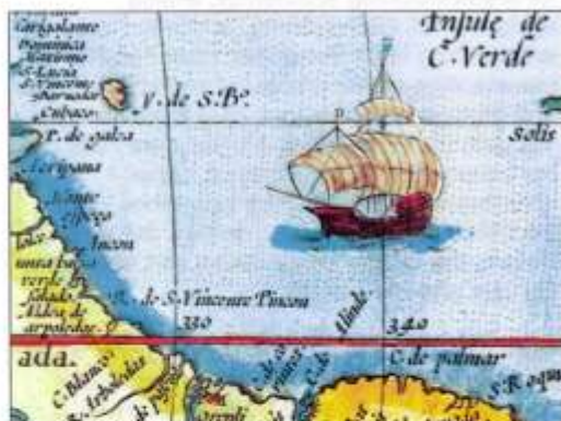
Ortelius' "New Description of America," from Theatrum Orbis Terrarum ( Theatre of the World , 1570), the first modern atlas.

Another Vault highlight is its range of distinctive gifts, from prints to umbrellas to gift card sets. UBC Library Vault's online gallery continues to grow, with new images added regularly, and plans have been made to create 12 new greeting card sets for 2009. Proceeds from the sale of these items support UBC Library initiatives and ensure that its collections endure for future generations.