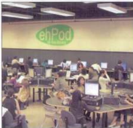
ehPod @ the Library

The extended hours computer lab (ehPod), which is open 7 days a week until 3 a.m., has been a huge success. Mouse pads with the ehPod logo are being used to promote the use of this facility.