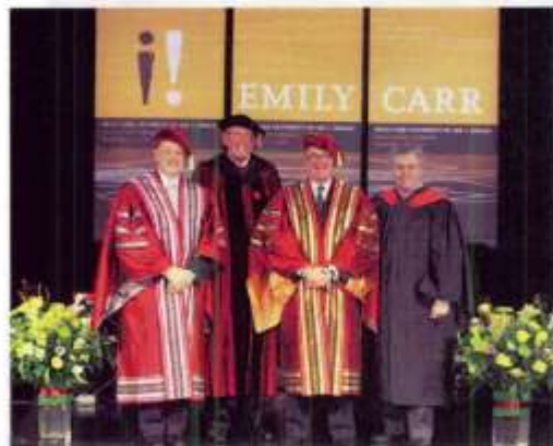
Installation of new Chancellor

submitted by Sheila Wallace, Director of Information Services